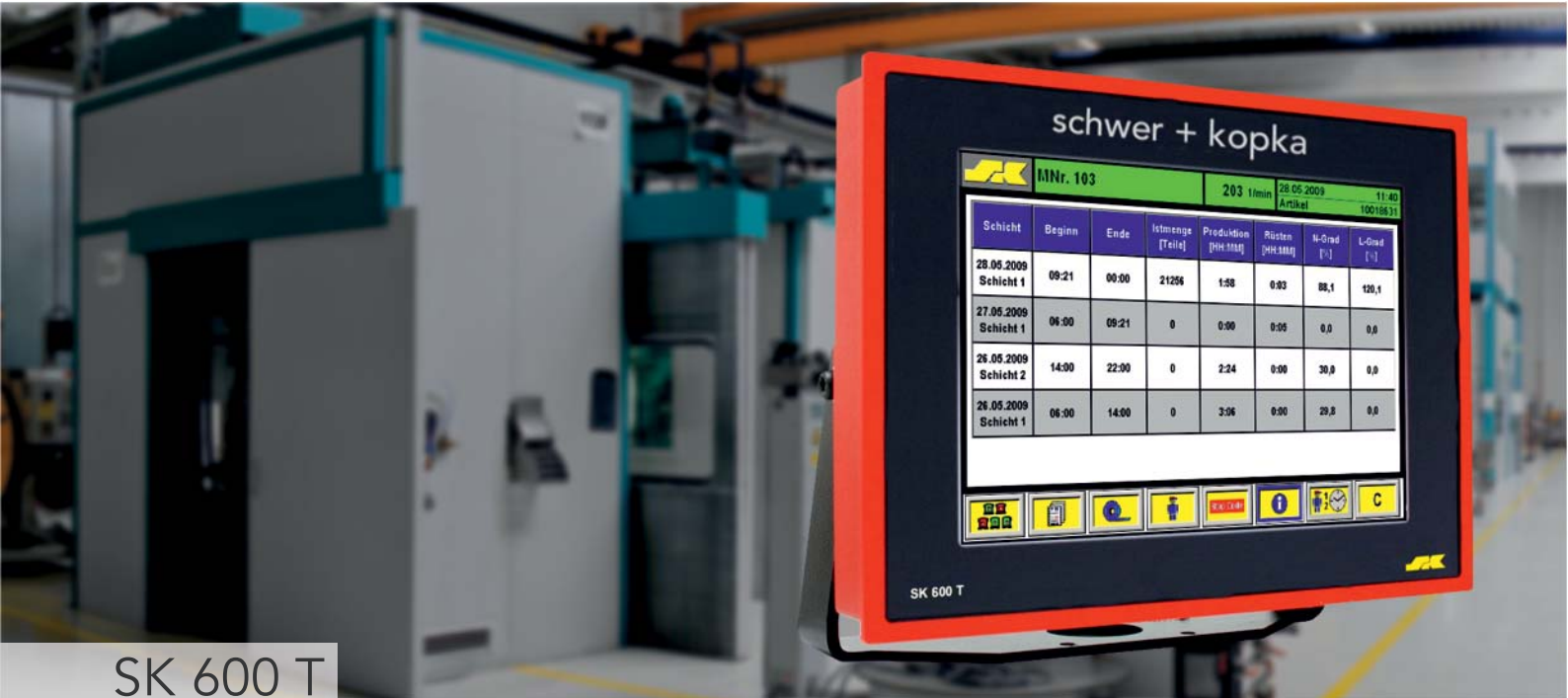
SK 600 T