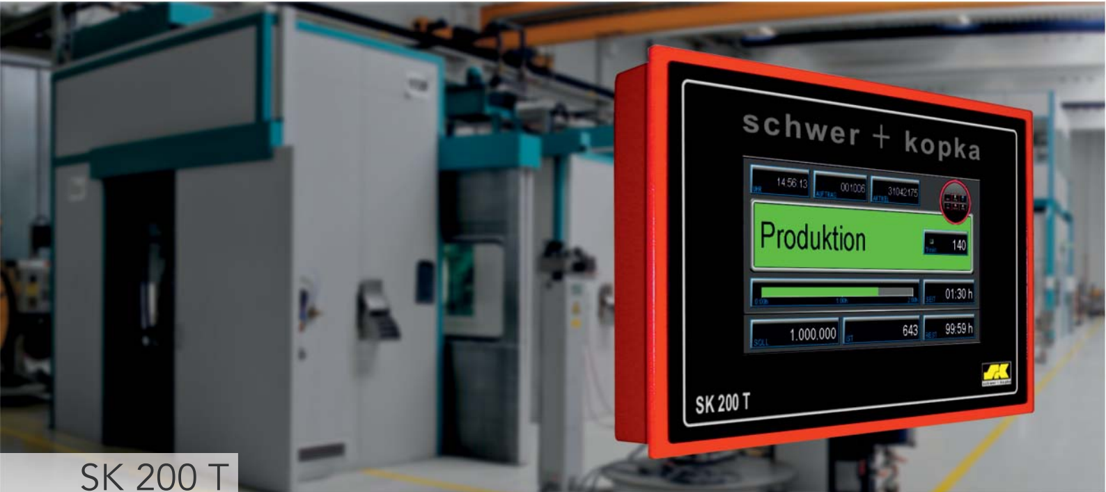
SK 200 T