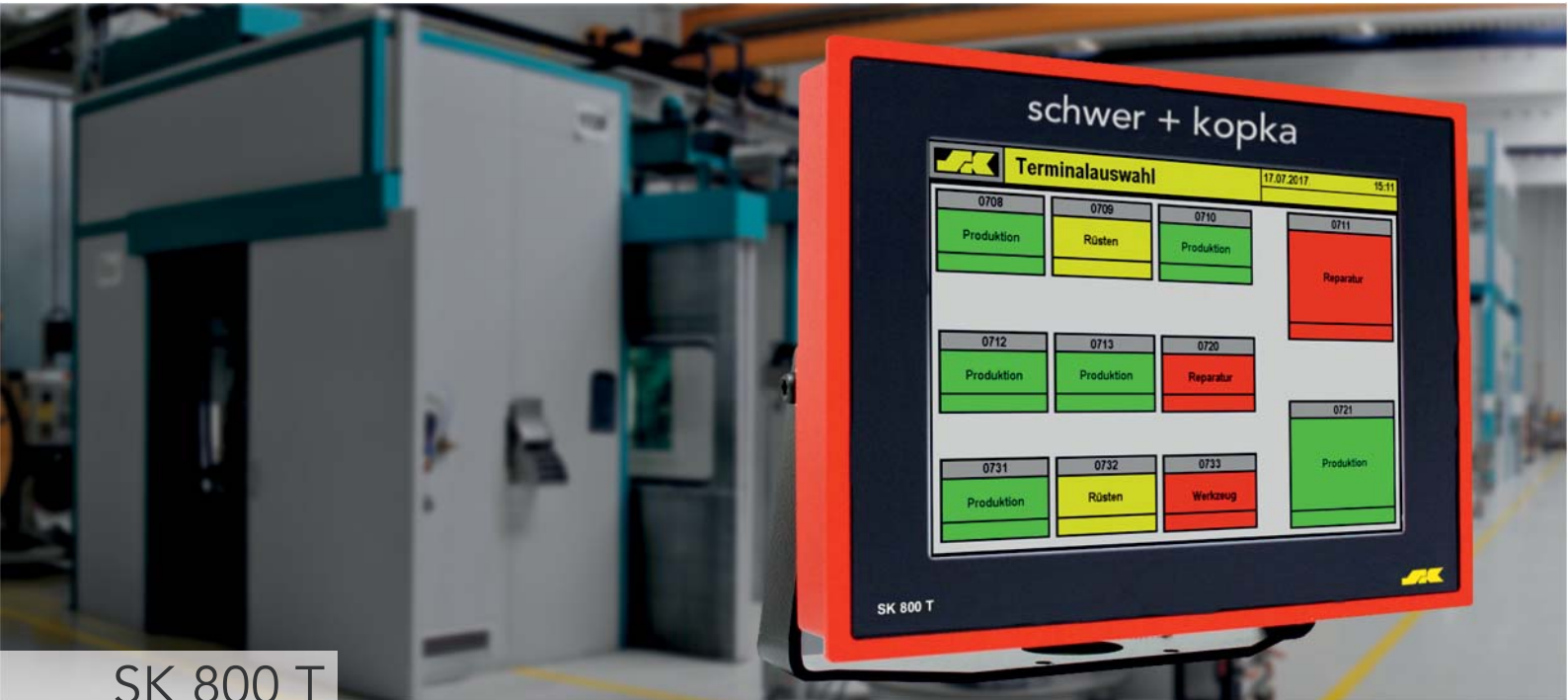
SK 800 T